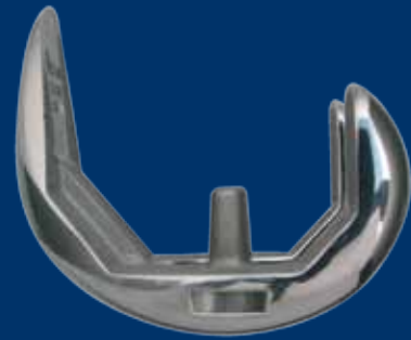
Femoral Component Cemented or Porous Posterior Stabilized