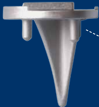
Tibial Baseplate Cemented or Porous Pegs or Pegless