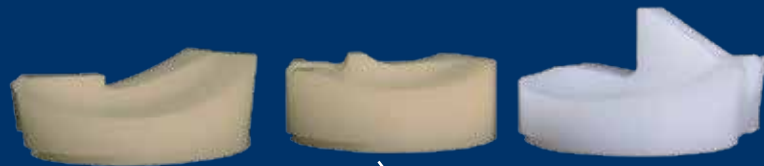
VitalitE Tibial Inserts PCL Substituting Cruciate Retaining Posterior Stabilized