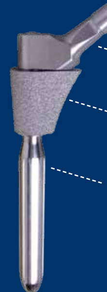
16 Neck Options