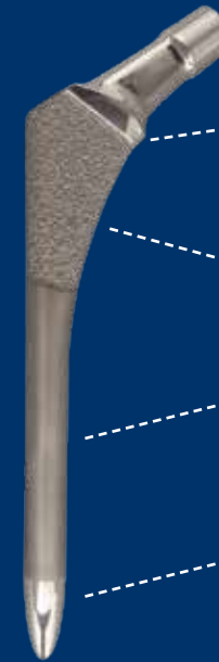
Collarless and Collar stems