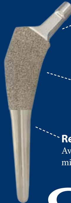
Standard and lateral offset options Restore biomechanics without lengthening the leg