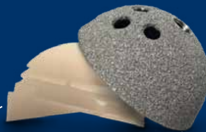
VitalitE Liners X-Linked Poly, Neutral, and Lateralized, available in Neutral 10° & 20° Hooded